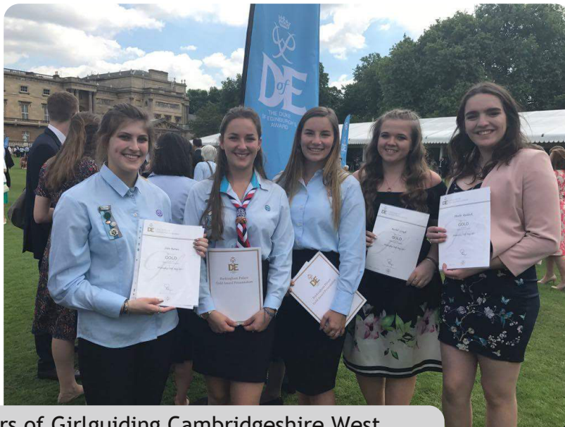
Members of Girlguiding Cambridgeshire West receiving their Gold Award at Buckingham Palace